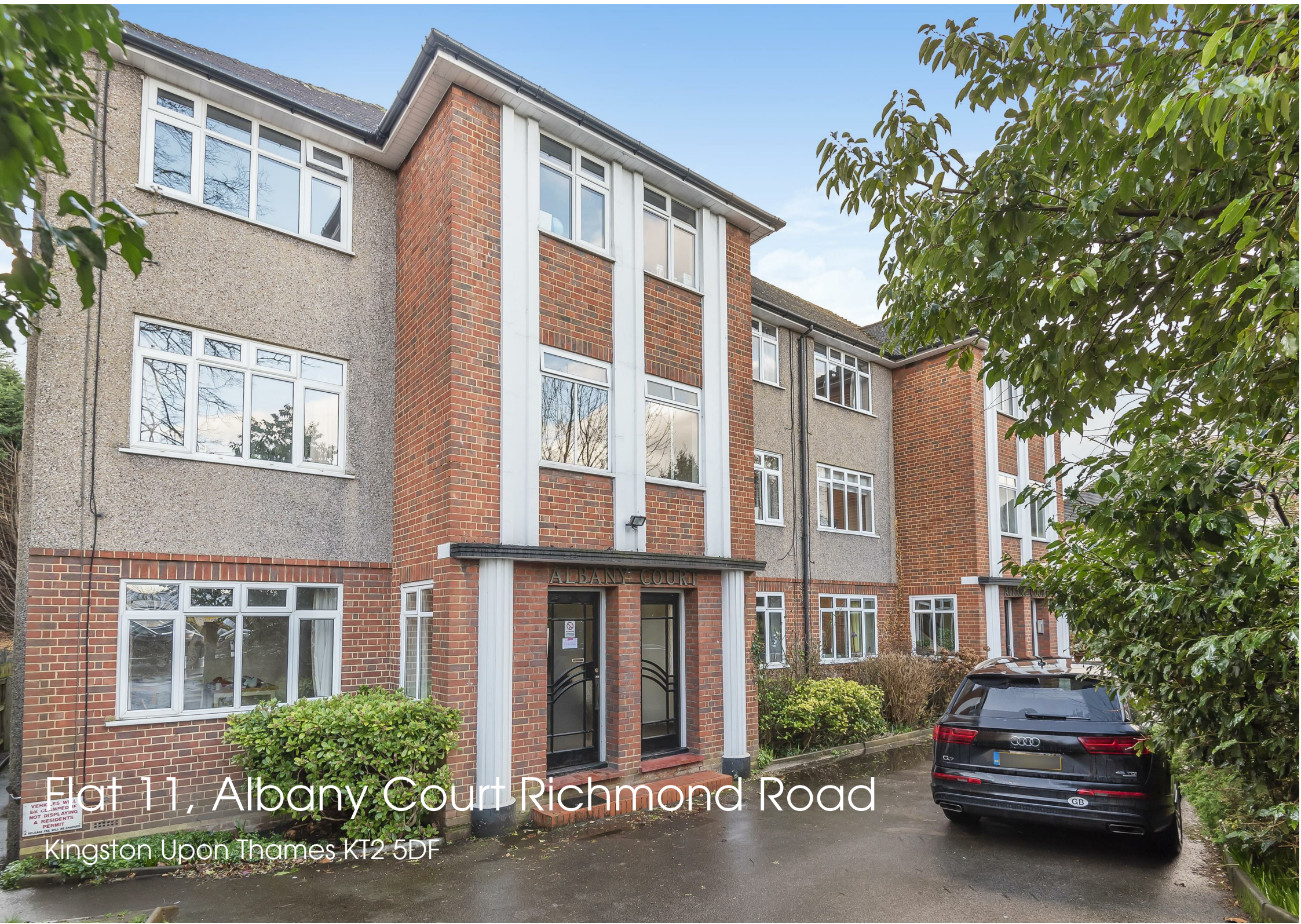
Flat 11, Albany Court Richmond Road Kingston Upon Thames KT2 5DF